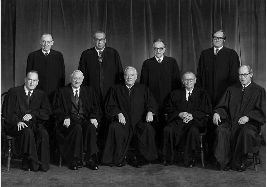
The Supreme Court that decided Roe v. Wade . This formal group photograph of the 1972 Burger Court was taken in August 1972. Seated, left to right: Justice Potter Stewart, Justice William O. Douglas, Chief Justice Warren E. Burger, Justice William J. Brennan Jr., Justice Byron R. White. Standing, left to right: Justice Lewis F. Powell Jr., Justice Thurgood Marshall, Justice Harry A. Blackmun, and Justice William H. Rehnquist.