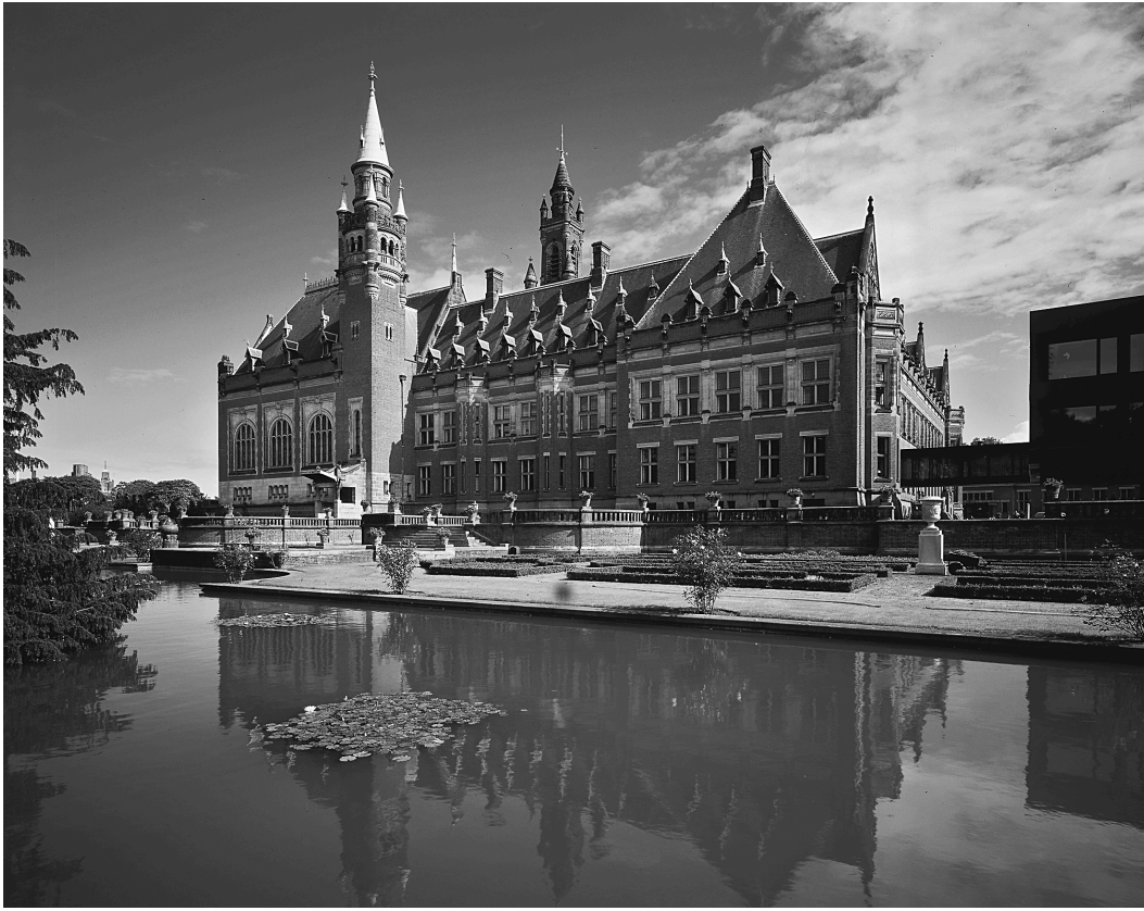
The Peace Palace, International Court of Justice, The Hague, the Netherlands.